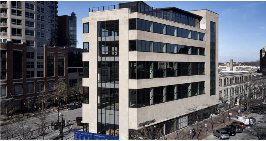
Image of completed 1616 Orrington Avenue