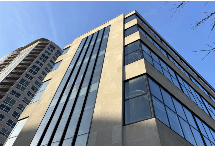
Image of completed 1616 Orrington Avenue

On the inside its original core was relocated to the northern end of the building to allow for more open floor plates, this brought a new entrance on Orrington and an address change from 1601 Sherman Avenue. The ground floor was also split into two retail spaces, one of which has been occupied by a Sweetgreen since 2022. The fountain in front of the structure, after which it's named for, is set to be restored in the coming years .