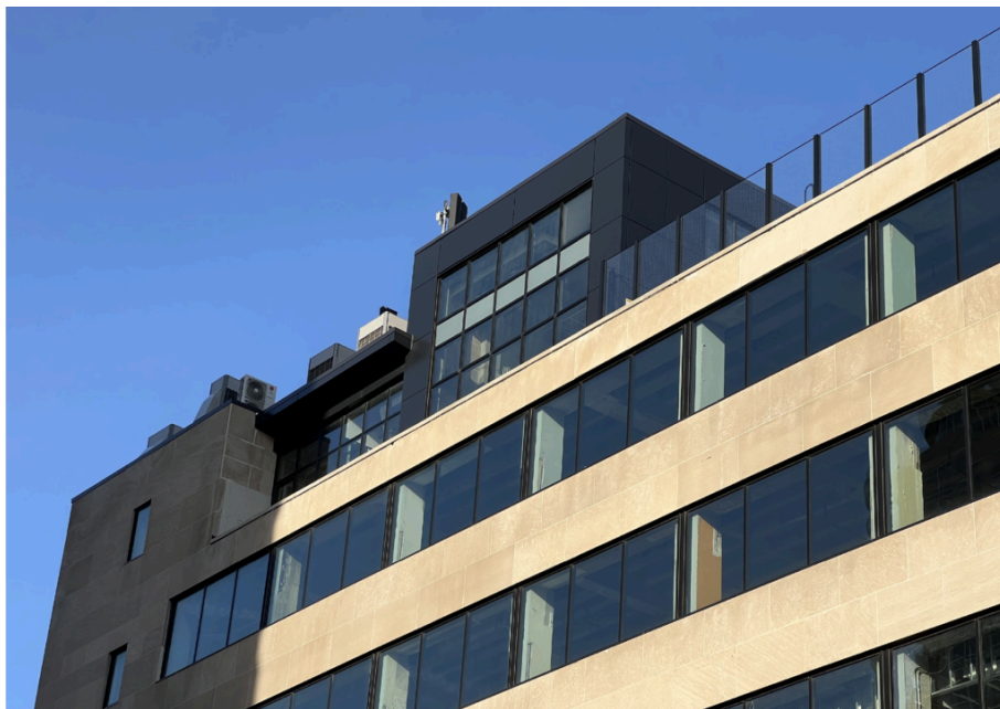
Image of completed 1616 Orrington Avenue