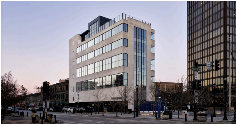
Image of completed 1616 Orrington Avenue