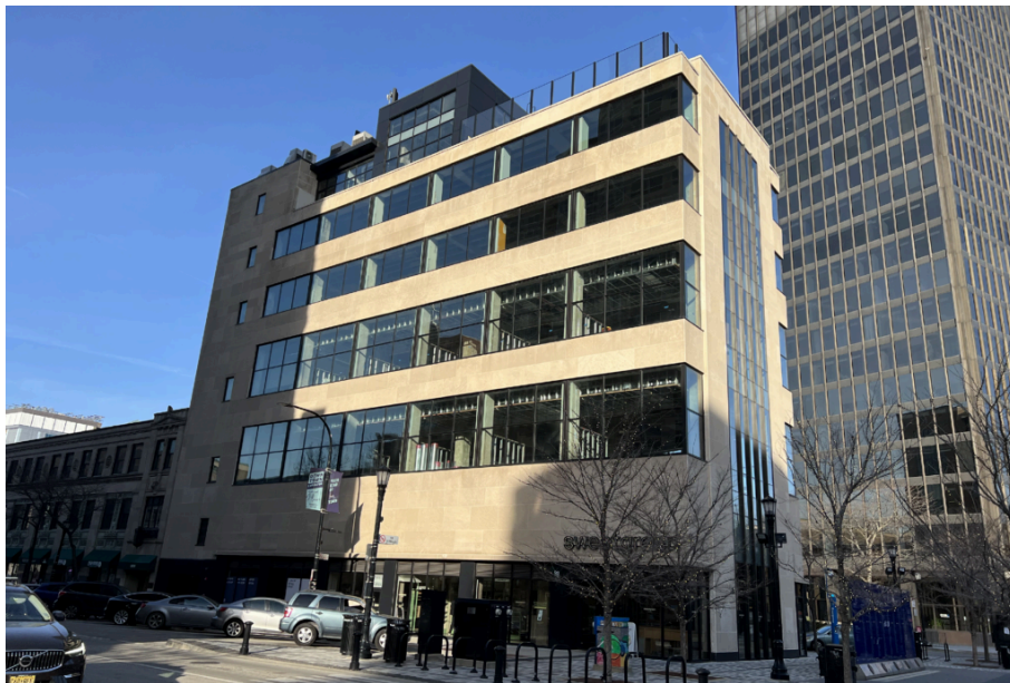
Image of completed 1616 Orrington Avenue