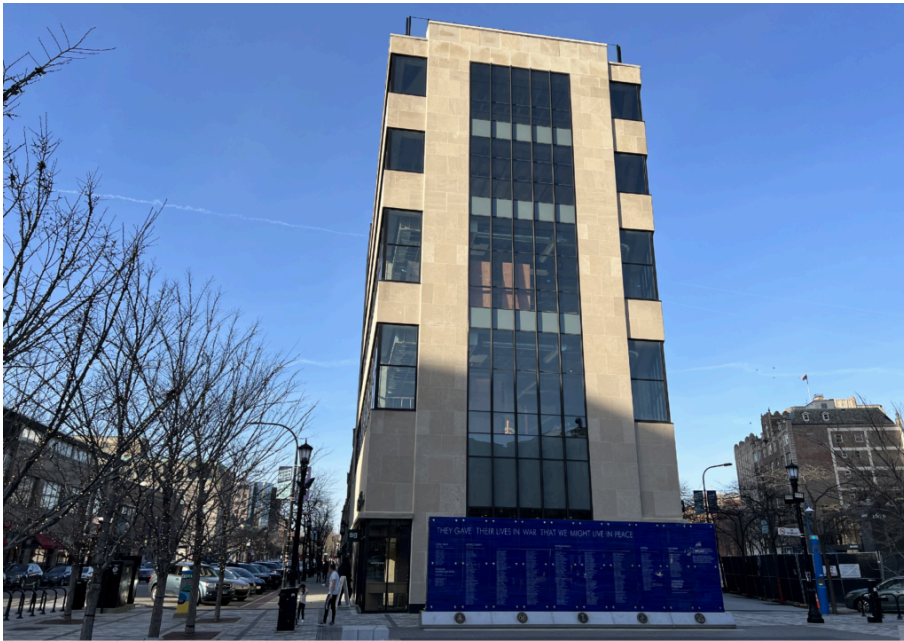
Image of completed 1616 Orrington Avenue

The building also received a new rooftop amenity space and bump-out that is well hidden from the ground, connecting to a south-facing deck with glass handrails to preserve the building's original lines. The project was built with bird deterrent glass as well and contains no vehicle parking spaces of its own. The project has begun leasing and complements other nearby developments like Evanston Labs .