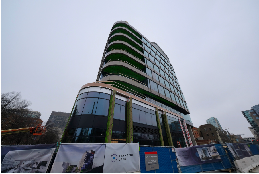
Evanston Labs.

The property is situated near the Metra line and the Davis station on the CTA Purple Line. Bus service for Routes 93, 201, 206, 208, 213, 250, and 422 are also accessible from this location. Additionally, the building offers 35 underground parking spaces, 100 off-site parking spaces reserved for tenants, electric vehicle charging stations, and an electric bike station.