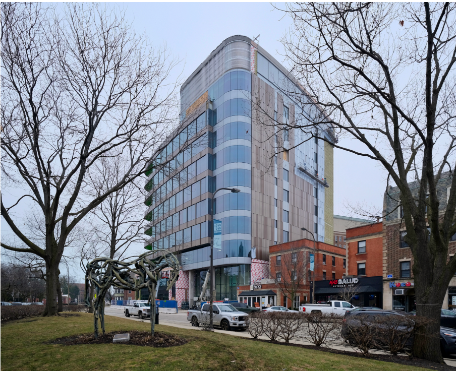
Evanston Labs. Photo by Jack Crawford