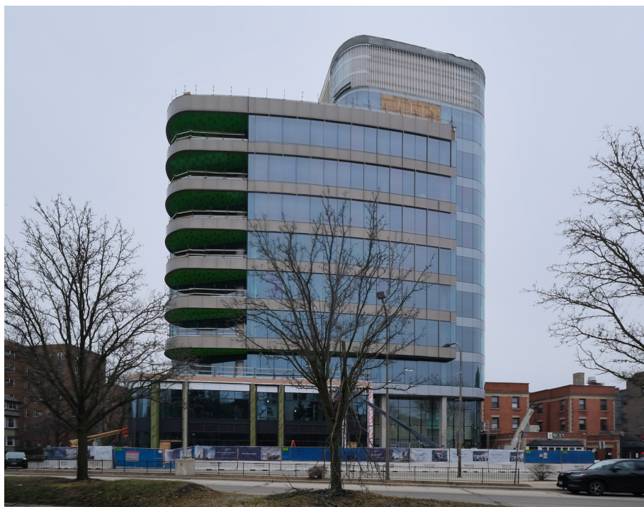
Evanston Labs.

Beyond functional spaces, the building has several amenities. These include a ground-floor Etta restaurant, private balconies, a collaboration center capable of accommodating 100 people, and a rooftop area. The rooftop features a boardroom, bar, lounge, an outdoor terrace with a fire pit and a lawn area, as well as a fitness center with locker rooms.