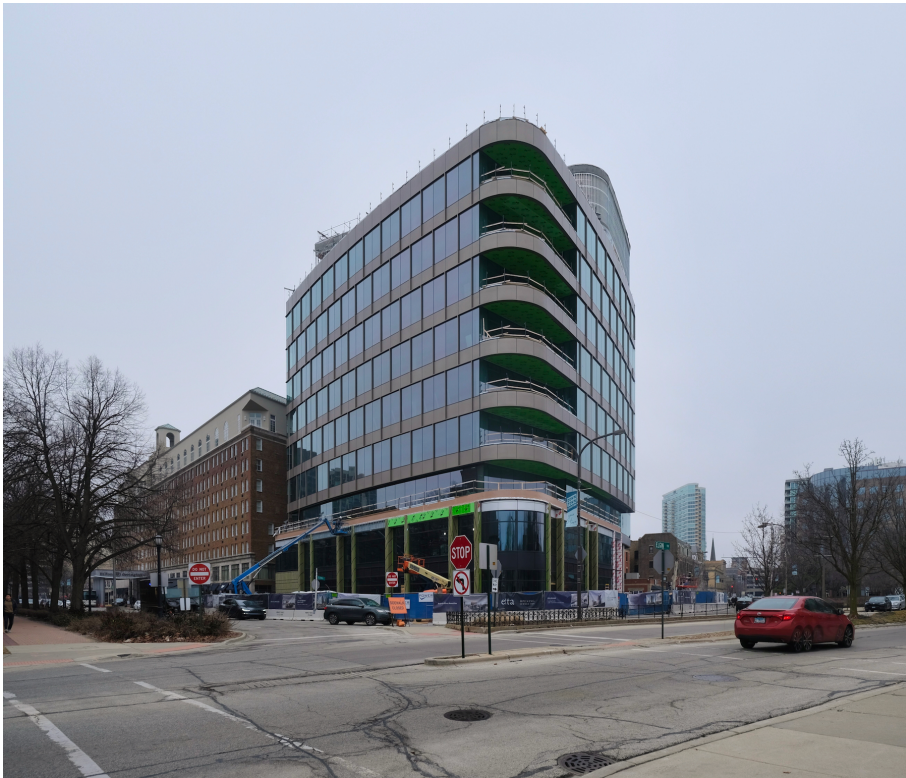
Evanston Labs.