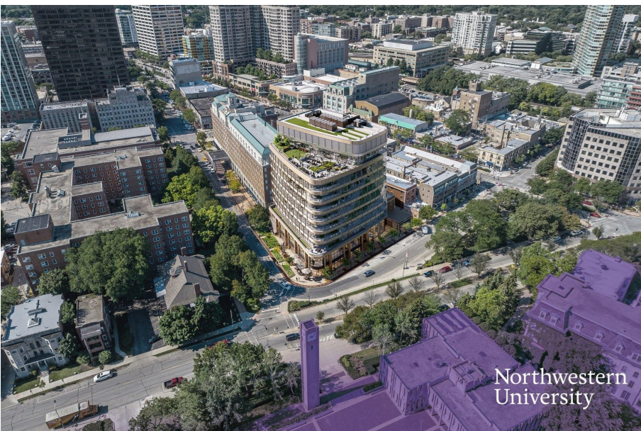
Evanston Labs. Rendering by ESG Architecture & Design