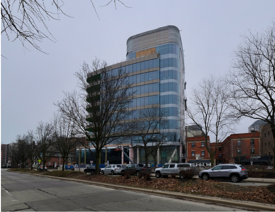
Evanston Labs.

Office and lab spaces within the will range in size from 5,000 to 9,500 square feet and feature ceiling heights between 14.5 feet and 16 feet. The building is equipped with a centralized chemical storage area and additional mechanical space on the top floor. It also includes vertical duct space near the core for specific installations required by tenants.