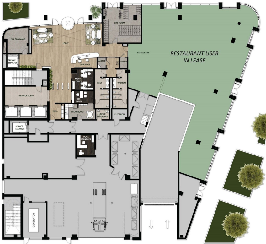
Evanston Labs first floor by ESG Architecture &amp; Design