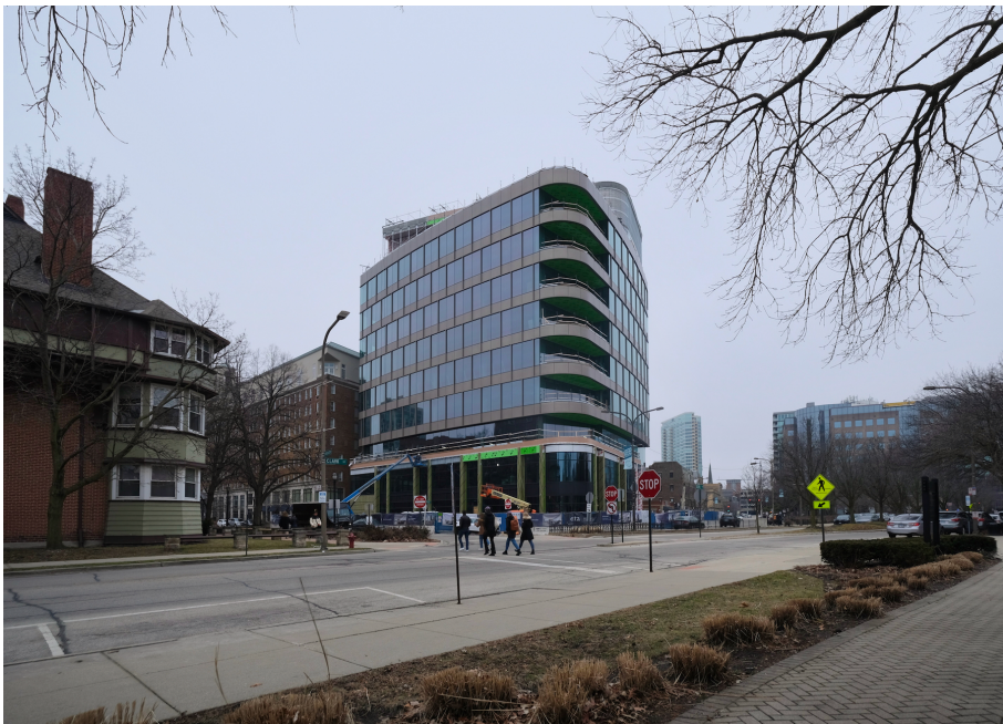
Evanston Labs.