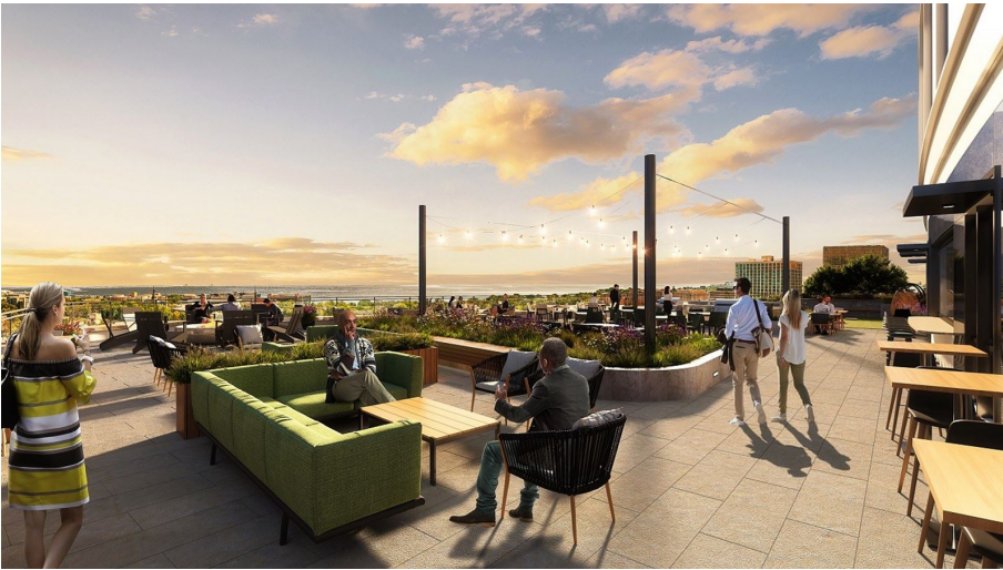
Evanston Labs. Rendering by ESG Architecture & Design