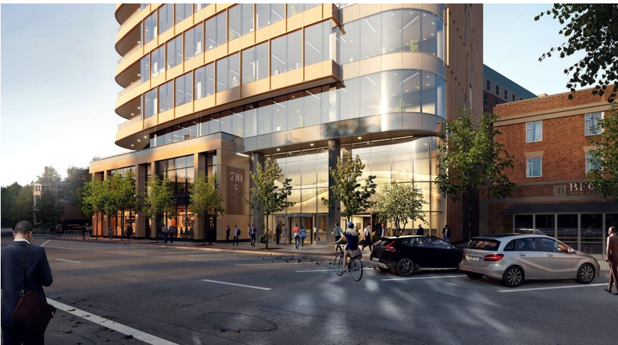
Evanston Labs.

Started in the last quarter of 2022 by Power Construction as the general contractor, the completion of the Evanston Labs project is anticipated by spring of this year.