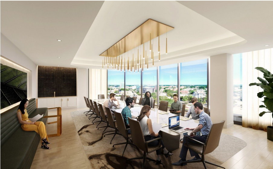
Evanston Labs. Rendering by ESG Architecture & Design