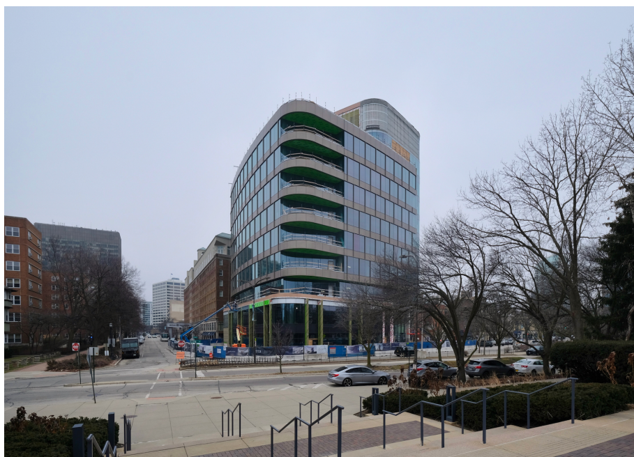
Evanston Labs.