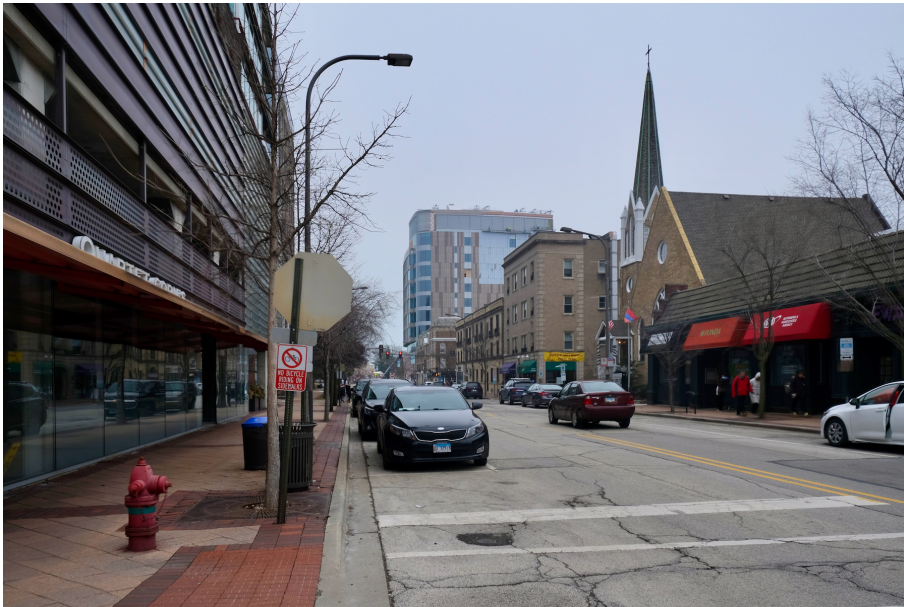
Evanston Labs.