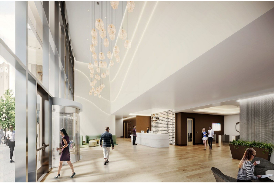
Evanston Labs. Rendering by ESG Architecture & Design