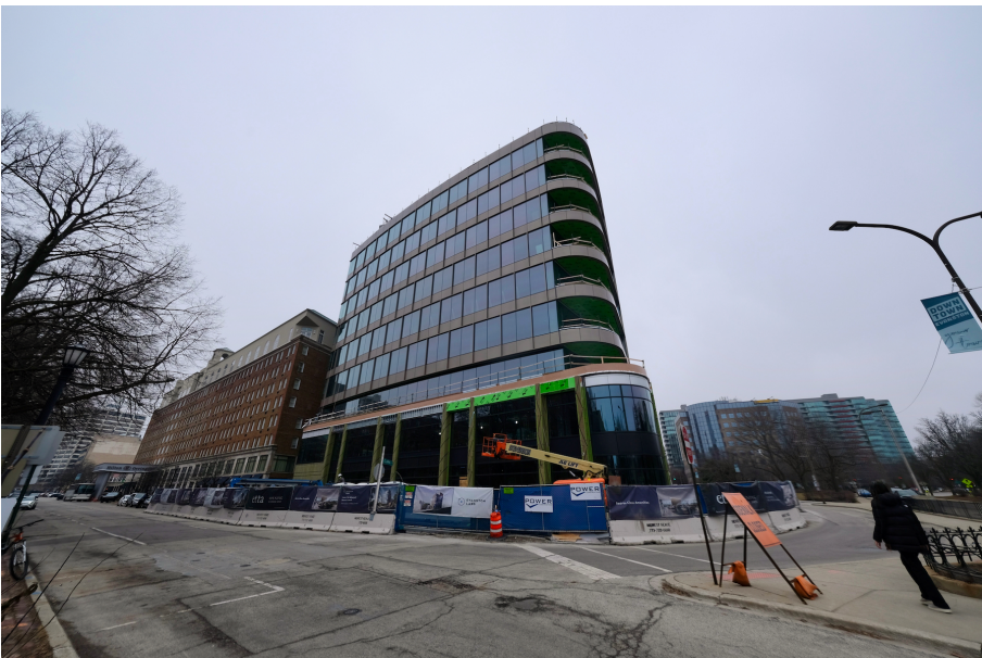
Evanston Labs.