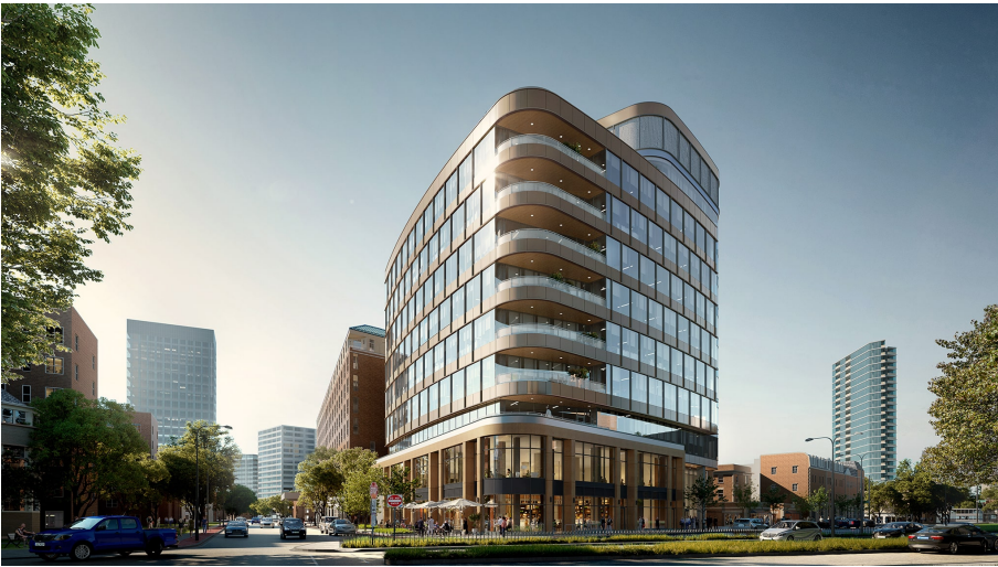
Evanston Labs. Rendering by ESG Architecture & Design