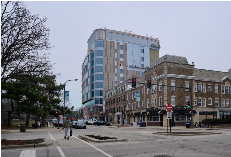
Evanston Labs. Photo by Jack Crawford