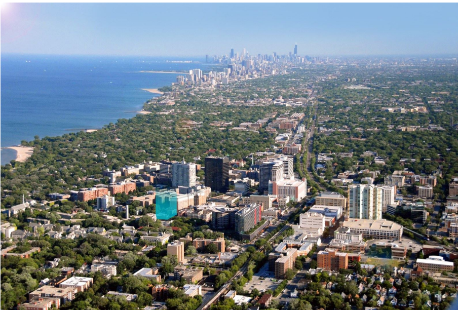
Evanston Labs. Context aerial by ESG Architecture & Design