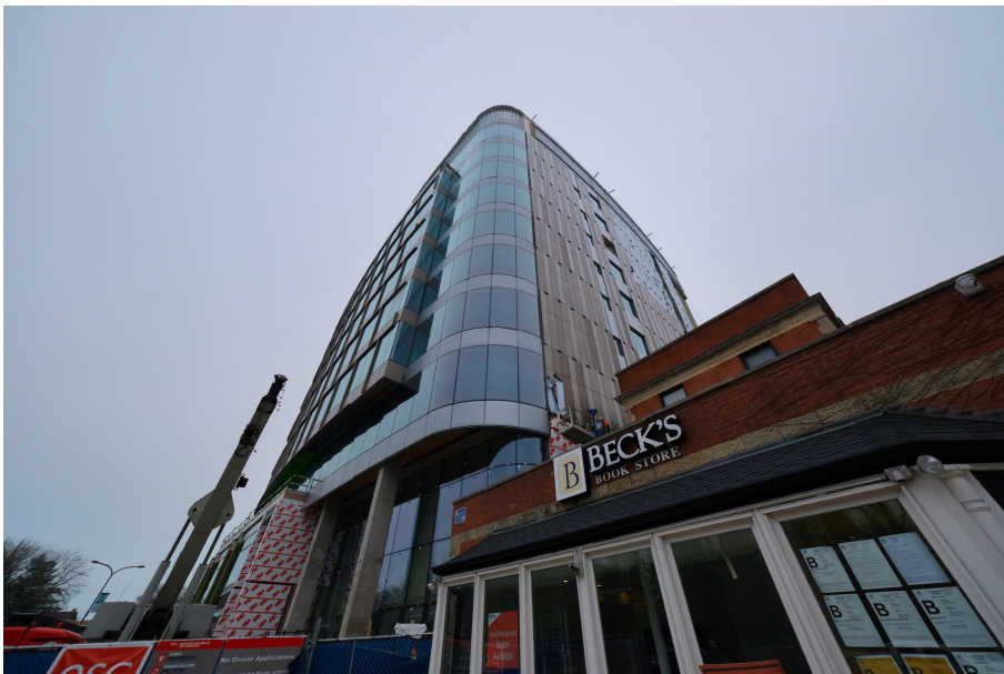
Evanston Labs.