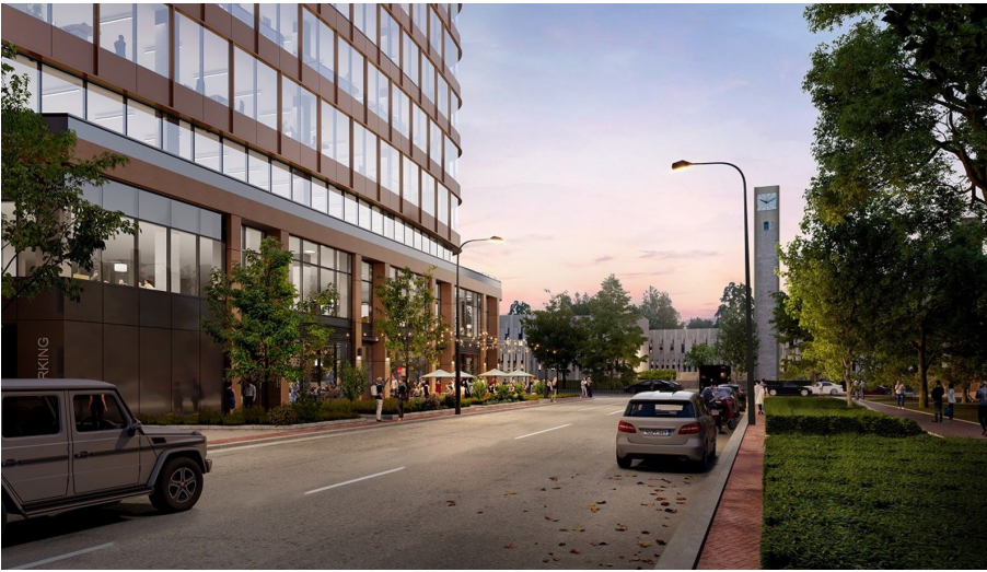
Evanston Labs. Rendering by ESG Architecture & Design