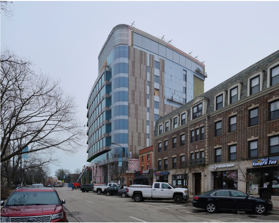
Evanston Labs.