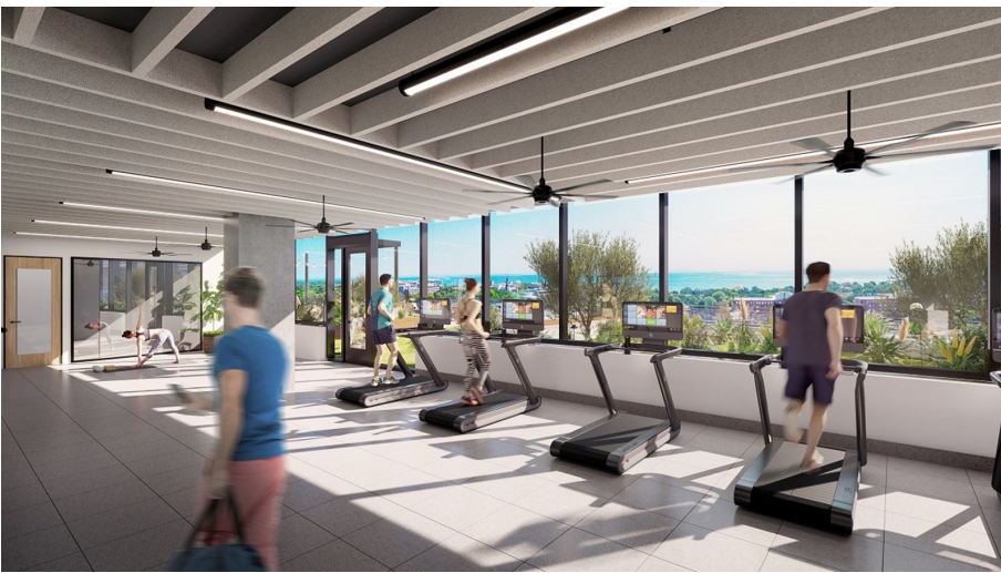
Evanston Labs. Rendering by ESG Architecture & Design