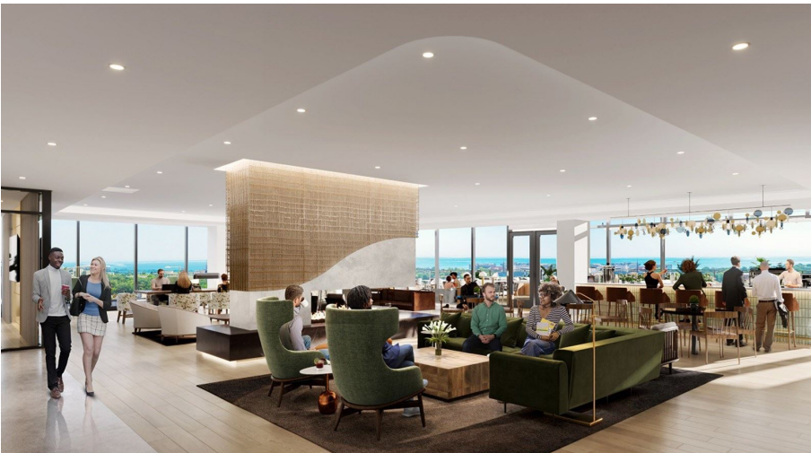
Evanston Labs. Rendering by ESG Architecture & Design