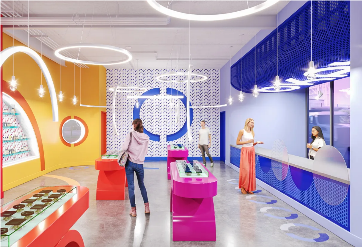
A rendering shows the Evanston Okay Cannabis store, set to open Feb. 9 at 100 Chicago Ave, on the corner with Howard Street. Credit: The Fifty/50 Restaurant Group

Evanston's second weed dispensary, Okay Cannabis , is now set to open Friday, Feb. 9 at 100 Chicago Ave. It will launch next to West Town Bakery and be the businesses' third combined location and West Town's sixth store, opening a few weeks behind schedule .