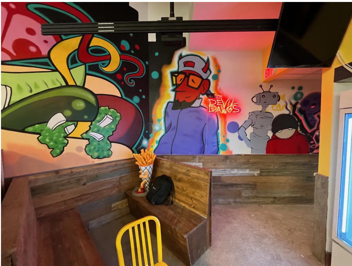
The interior of Devil Dawgs features graffiti-style artwork.

The Evanston Devil Dawgs' interior and menu will be similar to that of the other locations, with a menu of hot dogs, burgers and fries. The Evanston location will be the first with a liquor license, selling cocktails and craft beer.