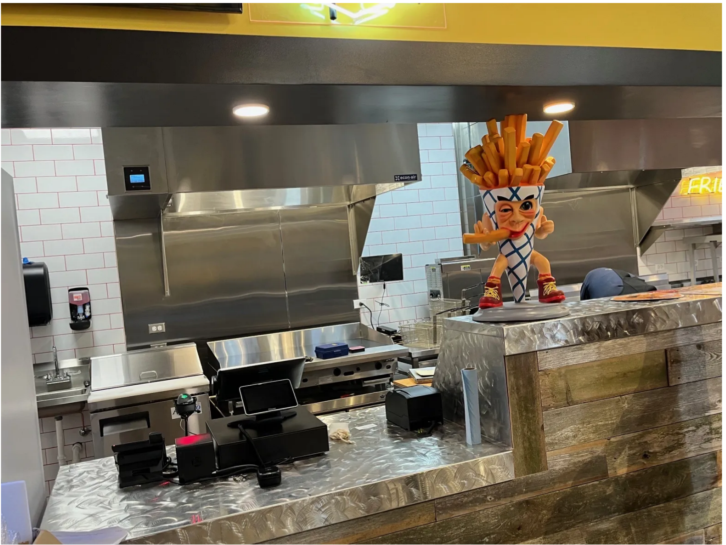
Devil Dawgs, 1711 Maple Ave., is set to have a soft opening Thursday ahead of a Feb. 5 grand opening.