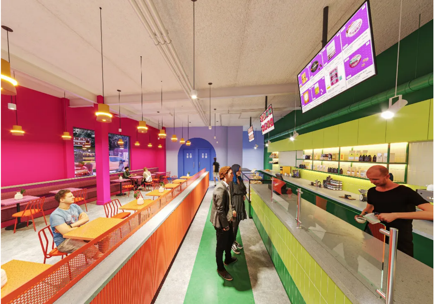
A rendering shows the Evanston West Town Bakery that will be attached to the Okay Cannabis location.

The Evanston Okay Cannabis location was initially set to open in July 2023 . The cannabis store, which is 93% Black- and Brown-owned, is classified as a social equity dispensary and has a license specific to individuals from groups that have been disproportionately affected by marijuana-related arrests and prosecutions. Last year, the Illinois Department of Financial and Professional Regulation gave Okay Cannabis a 180-day extension to meet license requirements, which allowed it to push its opening date to January 2024.